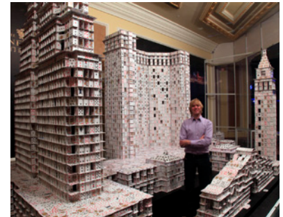
World's Largest House of Cards 2010