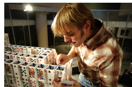
Berg building his grid-based technique