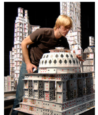
Berg constructing a dome